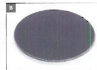
Resin holder disc.