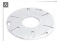
Redi Lock™ diamond holder disc.