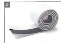
Rubber skirt, non marking.