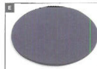
Resin holder disc replacement rubber pad.